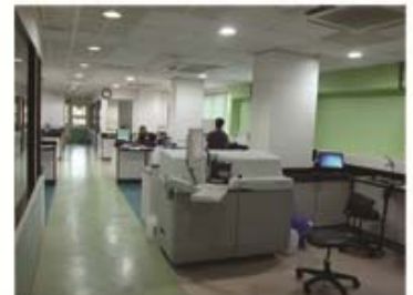
Department of Pathology and Laboratory Medicine