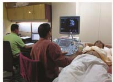
Department of Radio-Diagnosis and Advanced Imaging