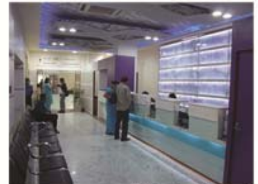
Main Reception Lobby on Level 1