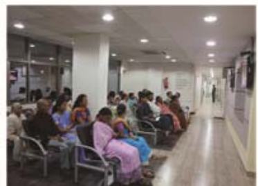
Level 2 Waiting Area