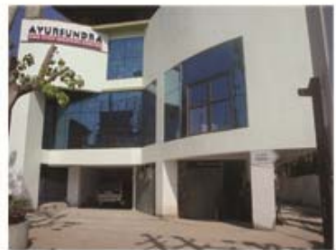
Ayurundra One Stop Medical Centre at Lachit Nagar

Lipid Profile (Total Cholesterol, Triglyceride, HDL Cholesterol, Direct LDL), FBS, PPBS, Haemogram (CBC with ESR: Hb, HCT, TRBC, MCV, MCH, MCHC, TLC, DLC, ESR, PBS) Liver Function Test with PT (Total Bilirubin, Direct Bilirubin, SGPT (ALT), SGOT (AST), GGTP, Albumin, Total Protein, Globulin, A/G Ratio), Blood Urea, Serum Creatinine, Na + , K + , Uric Acid, hsCRP, T3, T4, TSH, ECG, Chest X-Ray (PA View), TMT, Echocardiography, Diet Consultation, Cardiologist Consultation